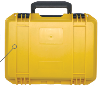
Upgradeable outdoor first aid packaging box